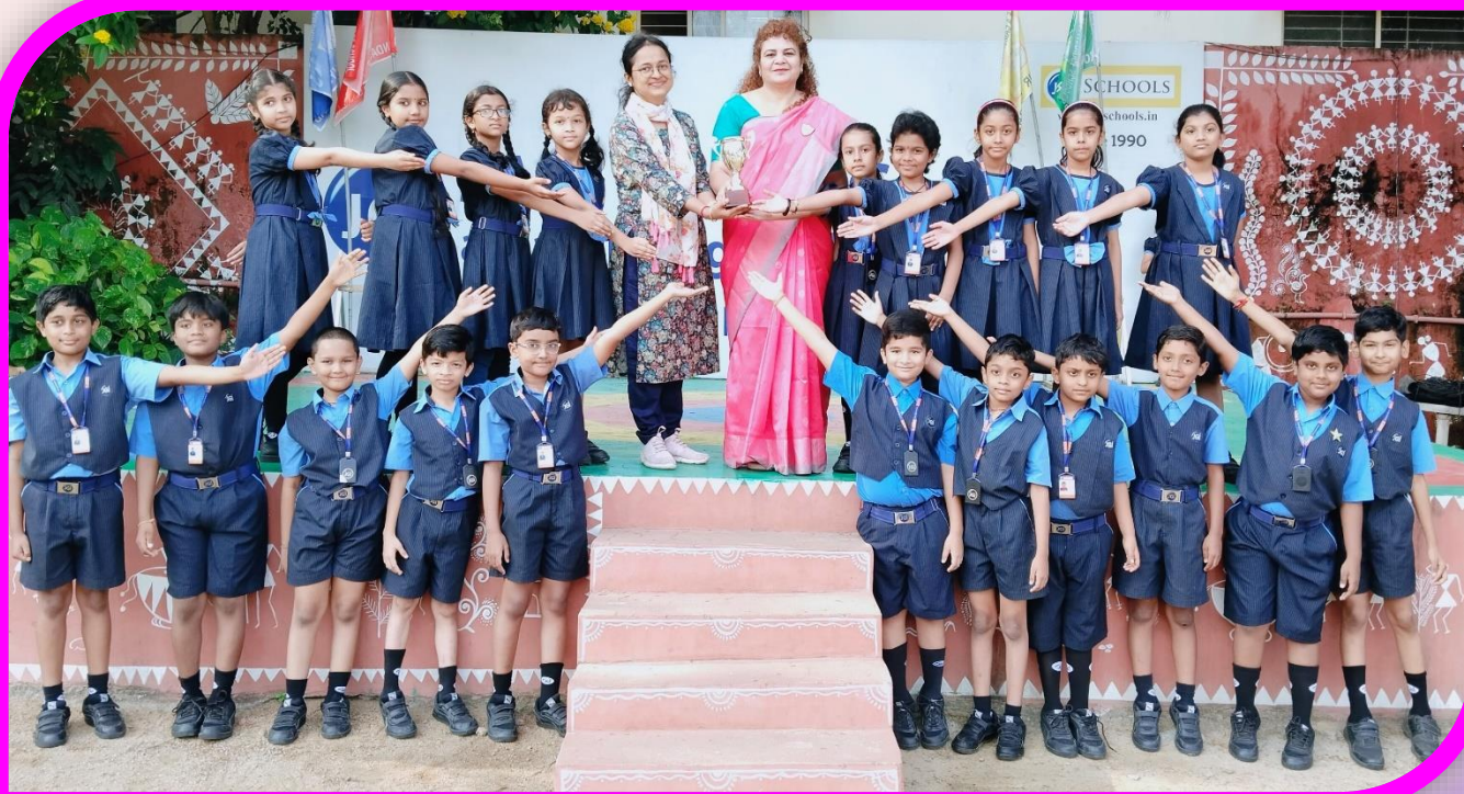
Grade- IV A (Junior)