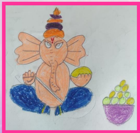
Rishitha – III B