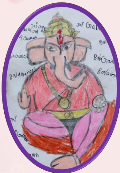
Jayanth – III A