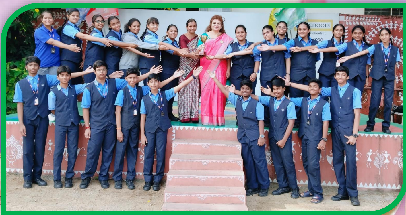
Grade- IX A (Senior)