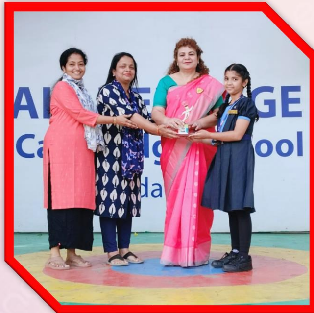
Ananth House (Junior)