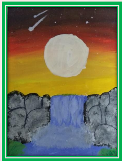
Mahesh Choudary – VIII B