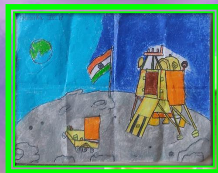
Hamsika – IV B