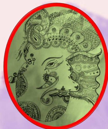
Ananya – VII A