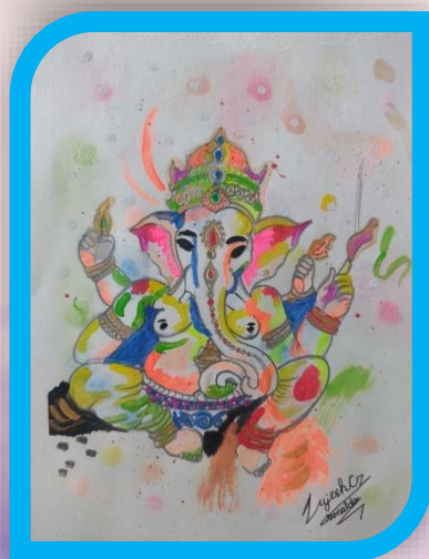
Ujesh – VIII B