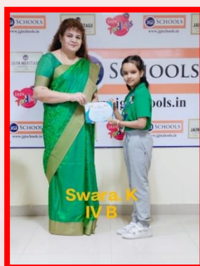
Swara K IV B